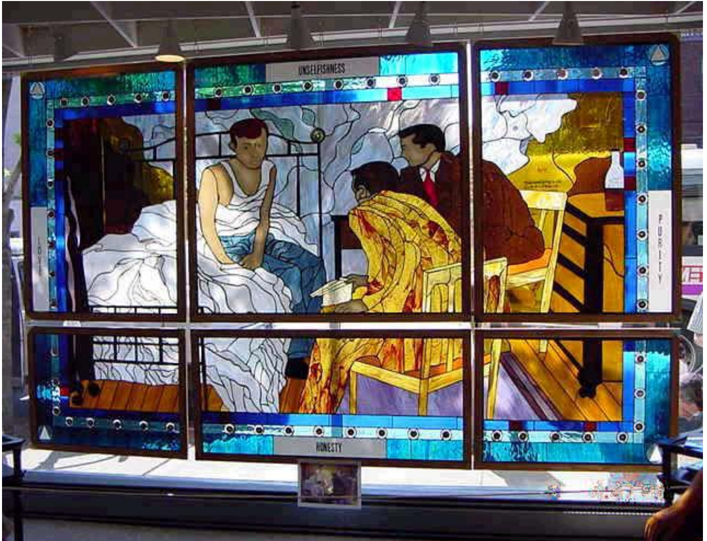
Stained Glass replica of "Man on the Bed"